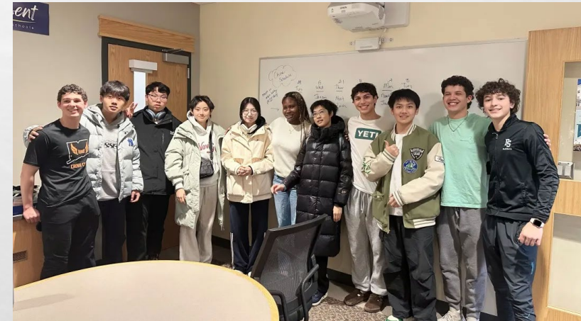
Meeting the ambassador Students at PSHS